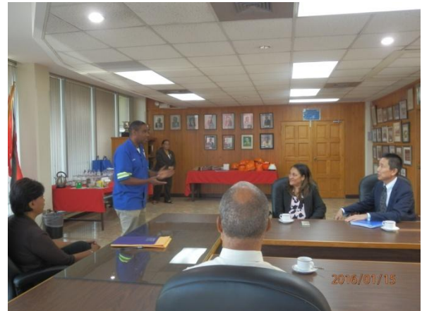
PATT Board Meeting